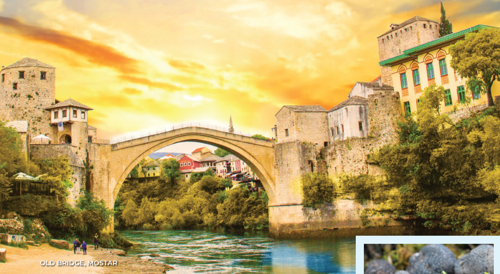
OLD BRIDGE, MOSTAR