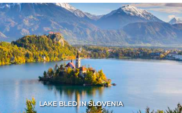
LAKE BLEED IN SLOVENIA

Passage and catch a glimpse of the remarkable Vivarium Proteus , also known as the human fish. Conclude your day by heading to Ljubljana , the vibrant capital of Slovenia.